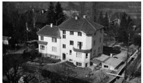
Hiscia Institute in 1952

A good example is the machine for the blending of the mistletoe preparations designed according to Rudolf Steiner's idea. The first machine was installed in 1928 and was continuously developed until finally, in 1972, Machine 6 succeeded in meeting Steiner's technical requirements.