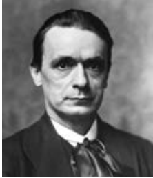
Dr. phil. Rudolf Steiner (1861–1925)

«ISCADOR, that's Weleda, right?» Not anymore – but here is how it all happened.