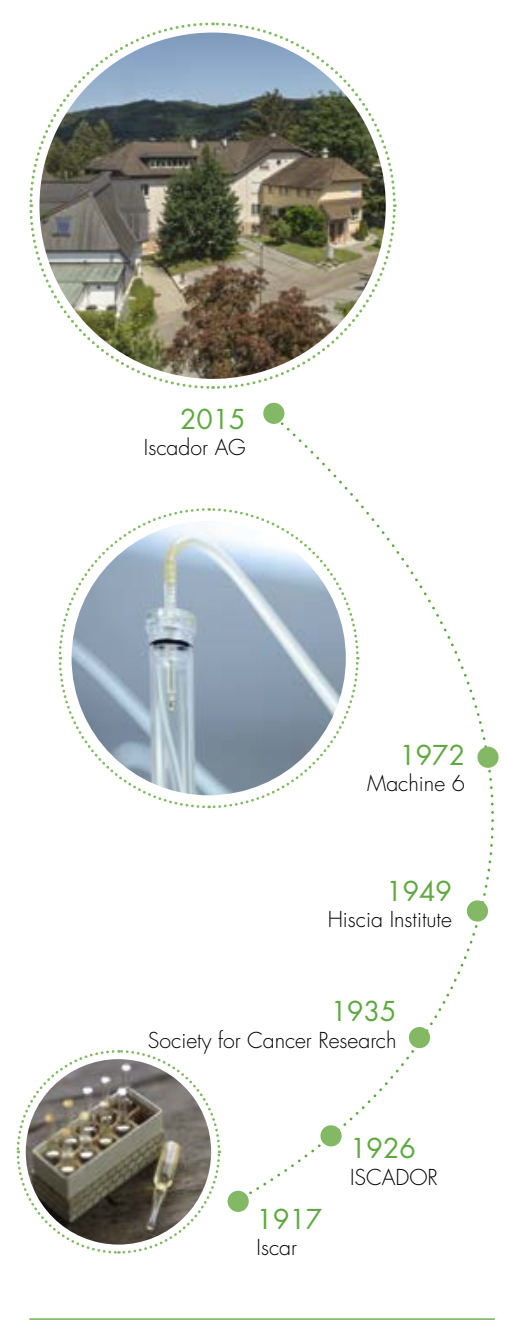
From harvest to medicine

Since 2015, Iscador AG has been managing all operational activities, including the marketing and worldwide distribution of the remedies. The employees and production facilities were integrated into the new organisation, and the long tradition of production and research of Hiscia Institute still lives on in Iscador AG. Every day, our employees contribute all their experience and enthusiasm to improve the quality of life for cancer patients. We are pleased to give you an insight and share our passion with you on one of our guided tours on our premises in Arlesheim.