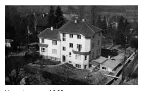
Hiscia Institute in 1952

A good example is the machine for the blending of the mistletoe preparations designed according to Rudolf Steiner's idea. The first machine was installed in 1928 and was continuously developed until finally, in 1972, Machine 6 succeeded in meeting Steiner's technical requirements.